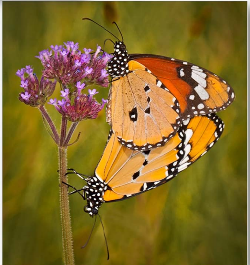
This is a lovely photograph of a mating pair of African monarchs ( Danaus chrysippus ). The top butterfly is the male and the bottom one the female. Notice how the male keeps on feeding while mating...