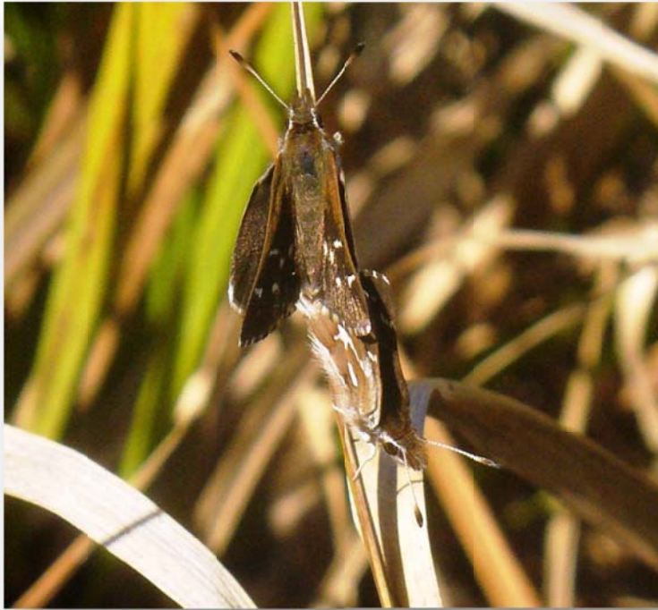
This mating pair of Barber's ranger ( Kedestes barberae bunta ) was photographed near Strandfontein in the Western Cape. It depicts one of South Africa's most endangered species of butterflies, but also shows some behaviour